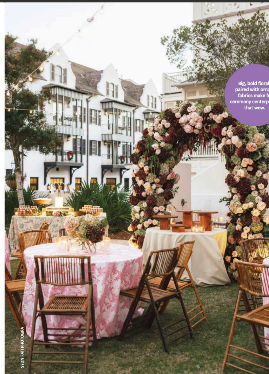
SYDNI FAIT PHOTOGRA