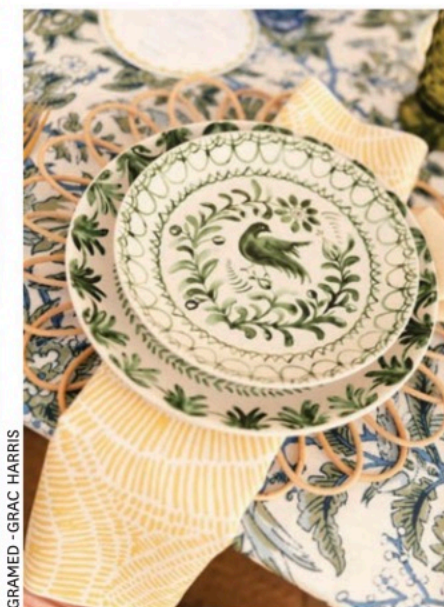
GRAMED - GRAC HARRIS