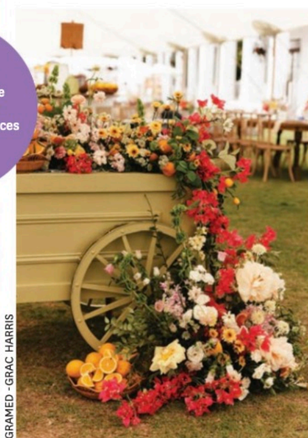
GRAMED - GRAC HARRIS

Big, bold florals paired with ornate fabrics make for ceremony centerpieces that wow.